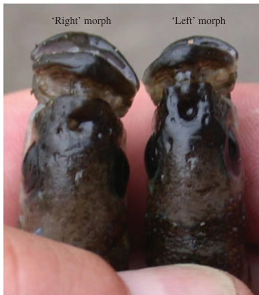
FIG. 1. Heads of the right and left morphs of Lake Tanganyikan scale-eating cichlid fish Perissodus microlepis .

A well-known example of antisymmetry is lateral dimorphism of mouth-opening direction that is found in several Lake Tanganyikan scale-eating cichlid fish species of the genera Perissodus and Plecodus . The heads of these fishes are asymmetrical: one morph has a mouth that is turned to the left [left morph; left-handed in Hori (1993)] and the other morph's mouth opens to the right (right morph; right-handed) (Fig. 1). Note that although Hori's (1993) original definition of left-handed (sinistral) and right-handed (dextral) has recently been re-defined as righty and lefty, respectively (Hori et al. , 2007), here the initial definitions are used since in the anatomical literature features are described from the perspective of the subject rather than the observer.